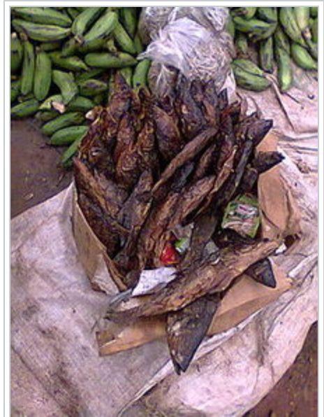
Dry tilapia in a market in Uganda

The Niger Barb ( Barbus bynni bynni ) grows up to 82 cm in length and 4 kg in weight. It is confined to the Nile and lakes that are, or were once, connected to the Nile. It feeds on crustaceans, insects, mollusks and organic debris. [7]