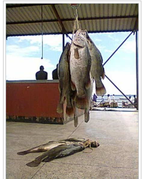
Nile perch on Gaba landing site

The Silver Cyprinid ( Rastrineobola argentea ), also known as the Lake Victoria Sardine, is locally known as "Mukene". [8] It is a small species of pelagic, freshwater ray-finned fish in the carp family (Cyprinidae) from East Africa, and can grow to a length of 9 cm (3.5 in).