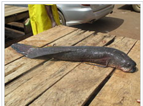
Lungfish at gaba landing site