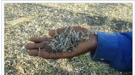
A fisherman holding Silver fish