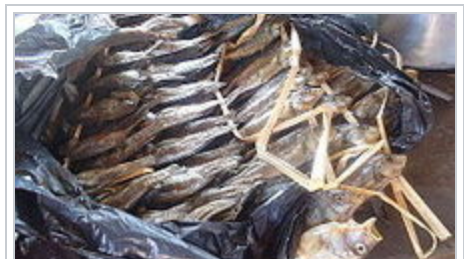
Sprat in a market in kalangala